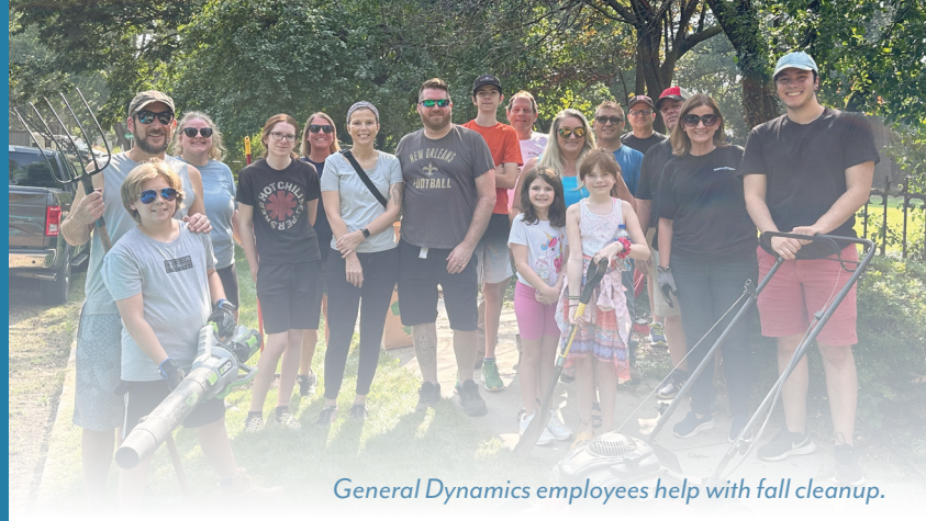
General Dynamics employees help with fall cleanup.