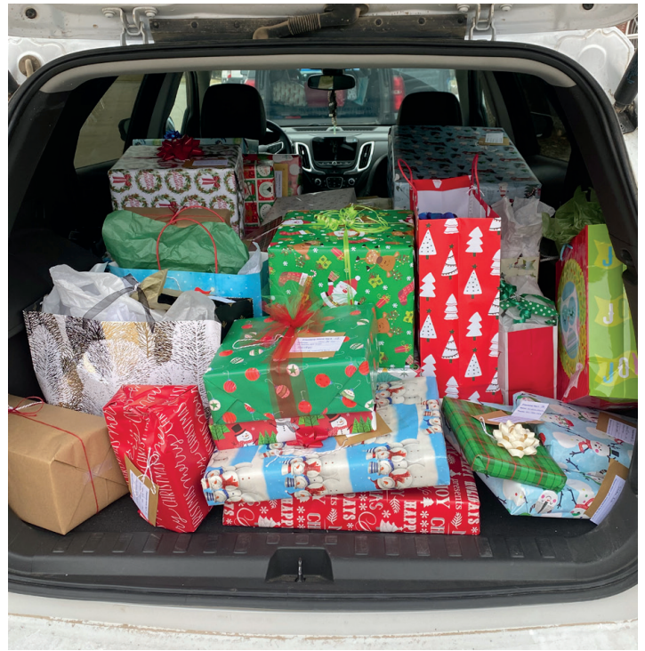
Supporters from Messiah Lutheran Church participated in a Giving Tree, allowing members of their congregation to purchase and wrap presents for Friendship Home survivors.

Each year, we are reminded that the work we do cannot be accomplished without the help of the Lincoln community. The generosity that we see during the holidays is a reminder that our community is committed to caring for others and supporting Friendship Home to be a hand to hold for those individuals fleeing domestic violence.